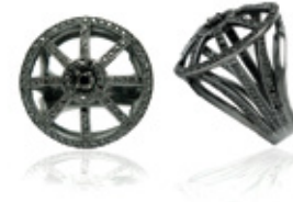
\\MINDHAM FINE JEWELLERY