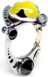
\\18 KARAT (FERROUS) \ Claudio Pino